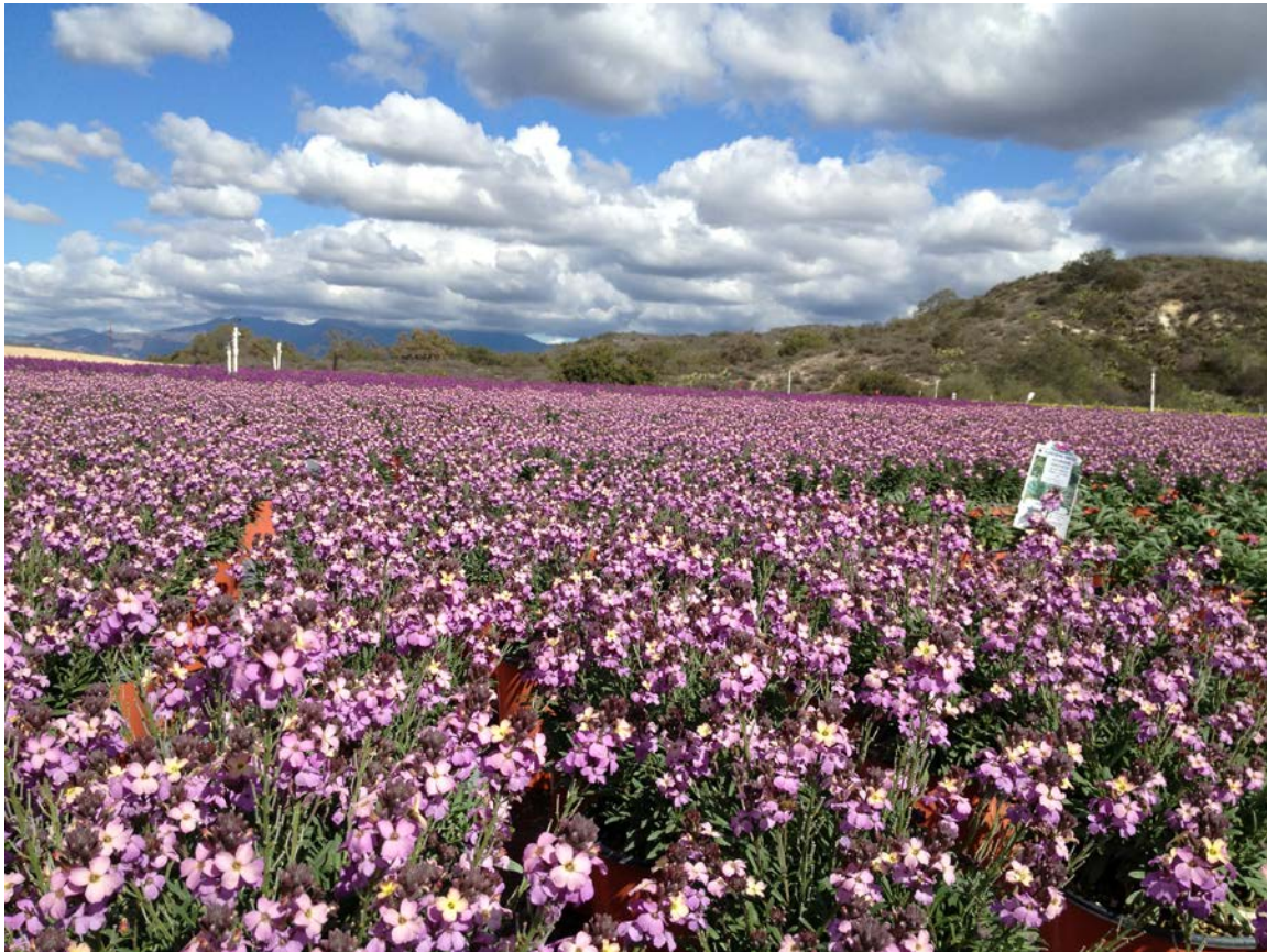
ERYSIMUM, Color Spot Holdings, San Juan Capistrano, 2014

*Includes: barley grain, lima beans, garbanzo beans, pasture rental, and barley forage