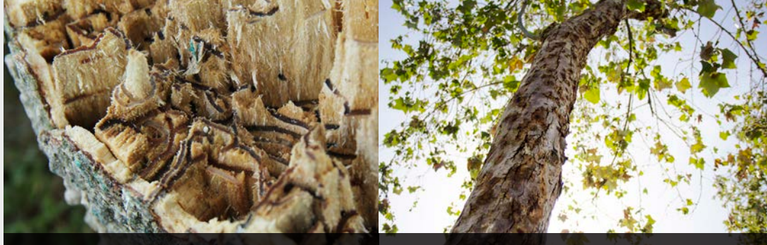
PSHB galleries in a box elder branch.