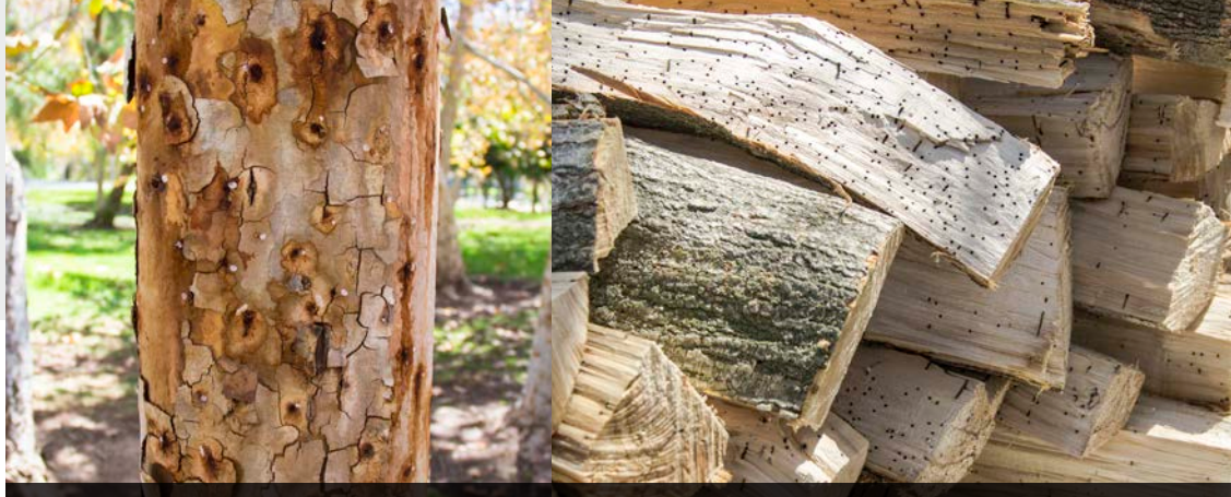
PSHB-infested sycamore in a research trial.

University of California Agriculture and Natural Resources